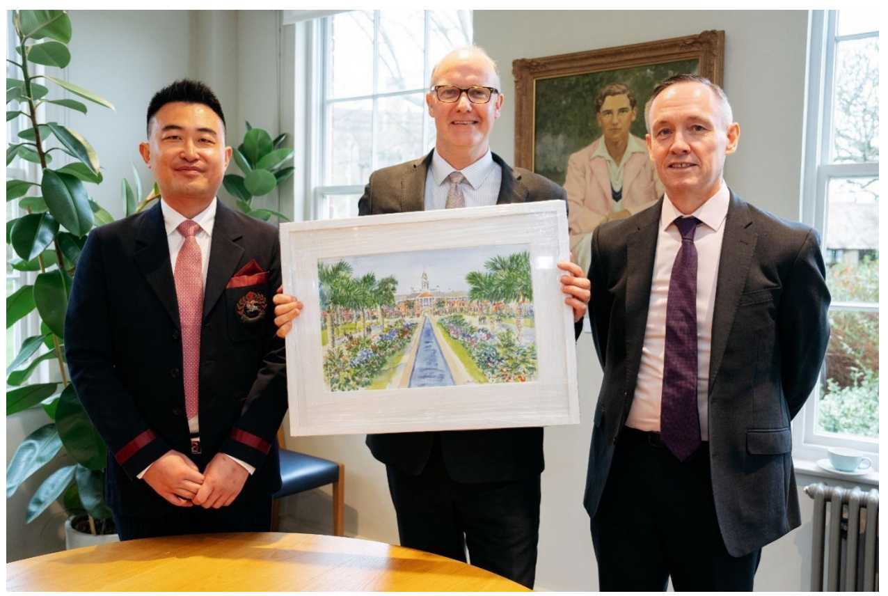
Official signing of the Charterhouse Lagos Agreement at Charterhouse UK